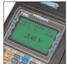
Customizable GUI display