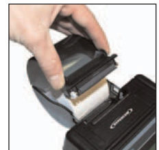
No-jam clamshell, integrated printer